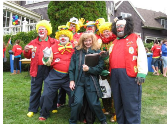
Shriner Clowns at Harvest Home with guess who?