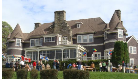
Beinn Bhreagh Hall and Harvest Home.

Shriner Clowns and old style games, folks dressed in the fashion of the early 1900's and more.