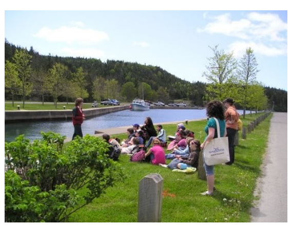
A school group enjoys a visit to St. Peters Canal NHSC.

overlooking the canal. The tour continues to the canal where visitors are given a demonstration of the lock operation unless the timing works so well that a boat is actually passing through. This month brought 3 school group visits.