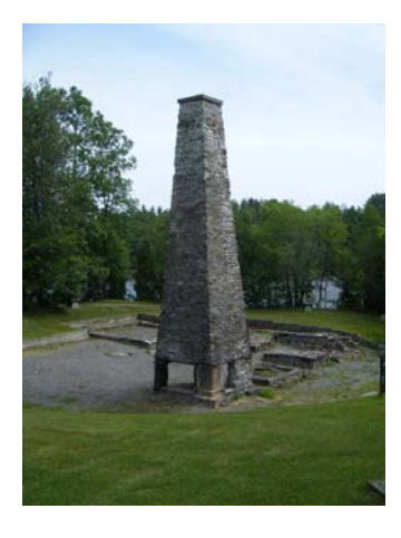
Remains of the first iron works in Canada, 1730 Les Forges du Saint-Maurice NHS