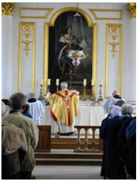
Latin mass @ Chapelle Saint-Louis