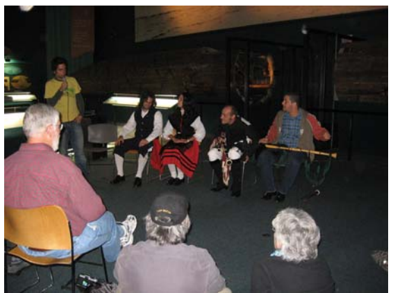
Performing during the Celtic Colours Bell Series are 'Gaiteros de La Habana' from Cuba

Our second annual Celtic Colours collaboration by way of the educational program the "Bell Series" brought a total of 595 participants over 5 days. On October 13 to 17 at 1 - 2 p.m. daily a performance/demonstration took place in our WATER exhibit area. The series included Celtic musical traditions from Cuba, Scotland, Canada, Wales and Denmark. As you may know, Alexander Graham Bell, along with all his other accolades, was an accomplished musician with a Celtic connection - he was born in Edinburgh, Scotland - great reasons for our Celtic Colours 'Bell Series'.