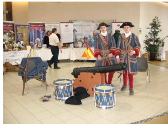
Visitors enjoyed the displays and demonstrations