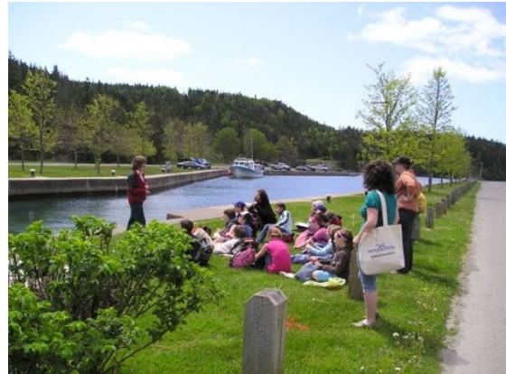
A school group enjoys a visit to St. Peters Canal NHSC.

overlooking the canal. The tour continues to the canal where visitors are given a demonstration of the lock operation unless the timing works so well that a boat is actually passing through. This month brought 3 school group visits.