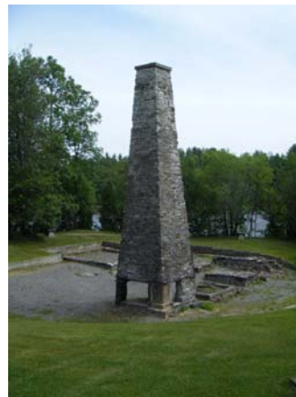
Remains of the first iron works in Canada, 1730 Les Forges du Saint-Maurice NHS