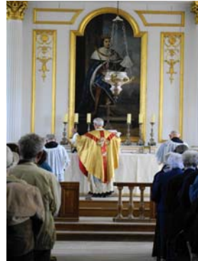
Latin mass @ Chapelle Saint-Louis