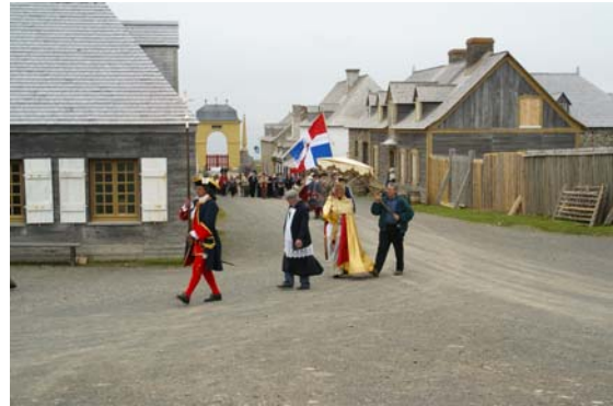
Corpus Christi 2009, Blessed Sacrament procession coming up Rue Toulouse